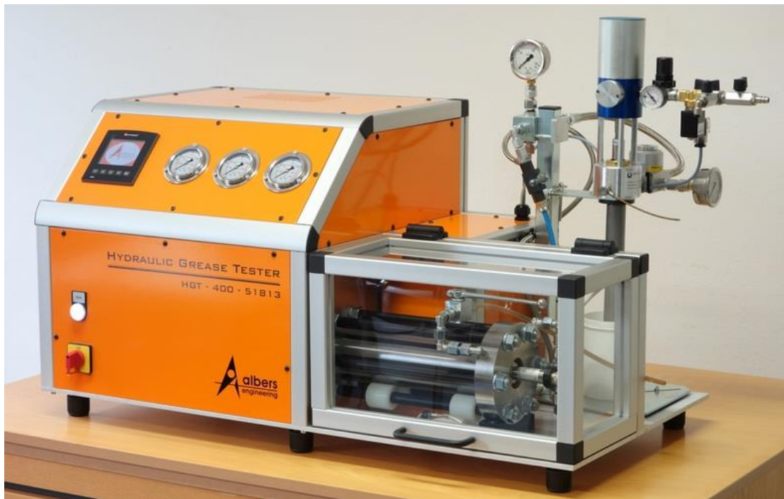
Hydraulic Grease Tester HGT-400-51813

(The actual appearance of the Instrument may differ slightly from the illustration)